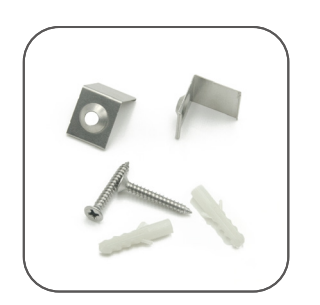
Mounting Clip (metal)